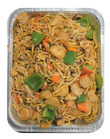
Lo Mein Sesame Chicken